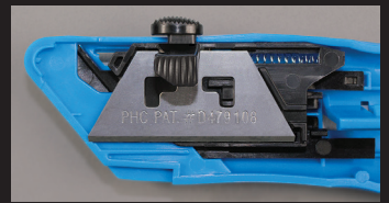
Insert new blade underneath blade retainer, align blade notch with alignment tab. Close cutter.