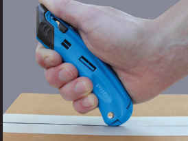
Blade-less tape splitting eliminates cut injuries