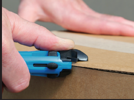
Spring back safety guards for safe top cuts