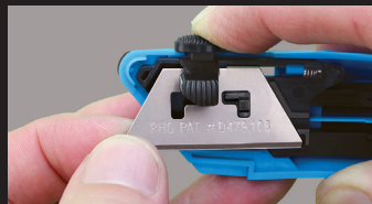
Remove used blade from blade retainer and dispose of safely.