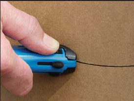
3 Button design for convenient tray cuts