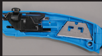
Remove spare blade from blade compartment. Use only S Series replacement blades: #SP-017, SPD-017 or PBDSP017B.